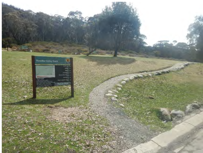
Figure 5: TVT trail head to be relocated and form part of new car park