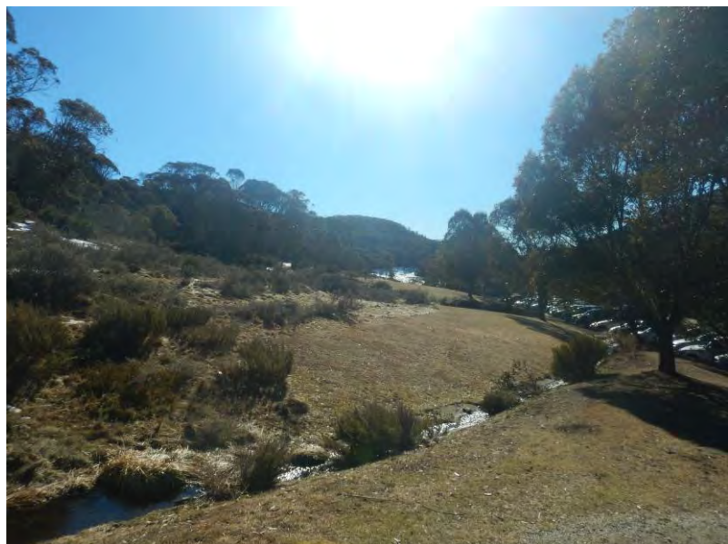
Figure 9: Existing drainage lines to be collected and re-directed