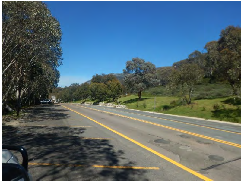
Figure 1: Photo of location of CP2 from Friday Drive