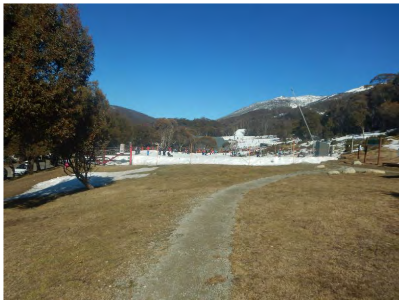
Figure 8: Adjacent Beginner Bowl located to the west