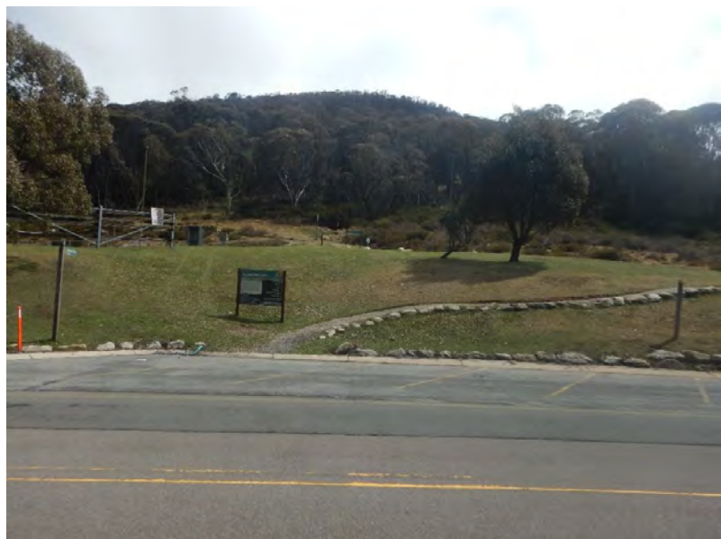
Figure 6: Location of entrance ramp to CP2