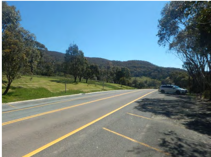
Figure 4: Photo of location of CP2 from Friday Drive