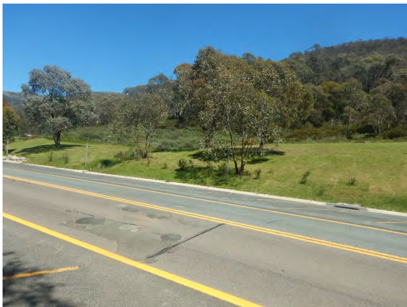
Figure 2: Photo of location of CP2 from Friday Drive