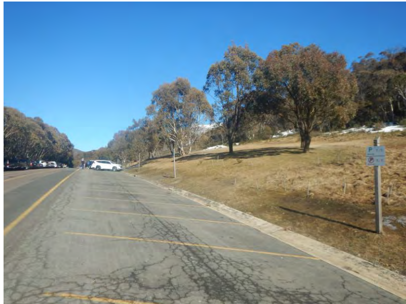
Figure 7: Existing angled on-street parking to be retained with a new footpath to be provided